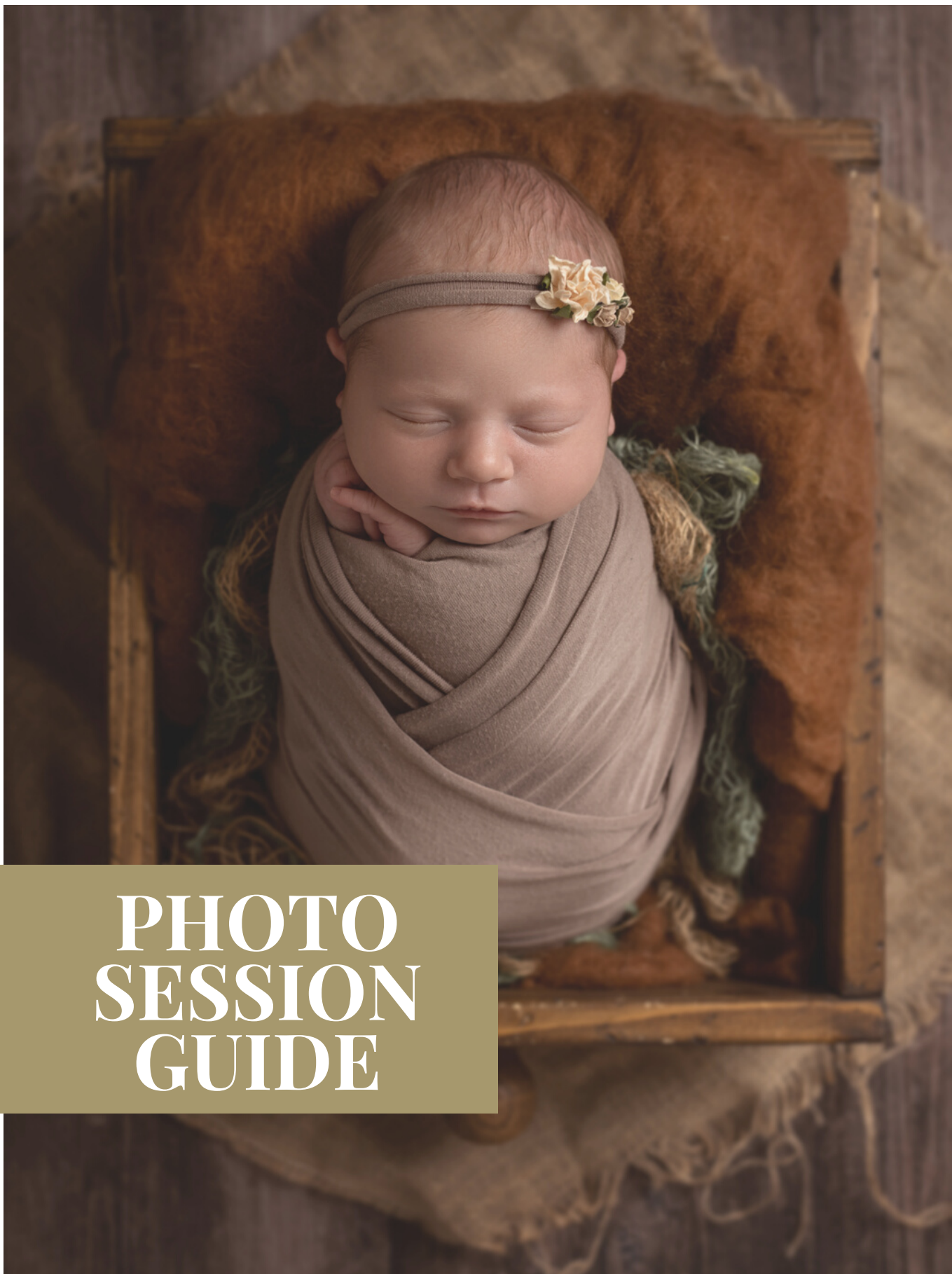
PHOTO SESSION GUIDE

GRAHAM BEWLEY PHOTOGRAPHY YOUR STORY IN PICTURES